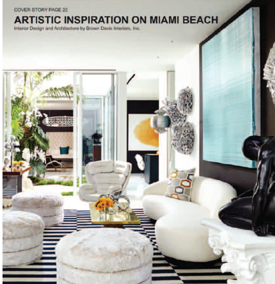
COVER STORY PAGE 22 ARTISTIC INSPIRATION ON MIAMI BEACH Interior Design and Architecture by Brown Davis Interiors, Inc.

IDEAS FOR BEAUTIFYING YOUR HOME WWW.FLORIDADDECOR.COM BROWARD/PALM BEACH EDITION | ISSUE 3 VOL. 11 2019